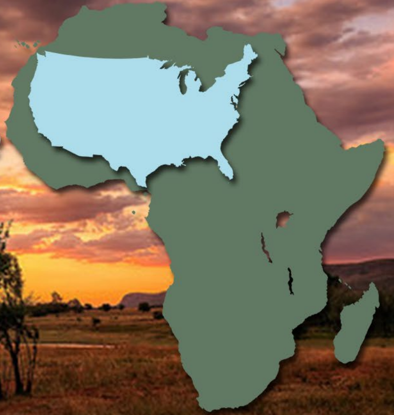
Size of the continent of Africa compared to the United States

The population of West Africa is over 280 million people